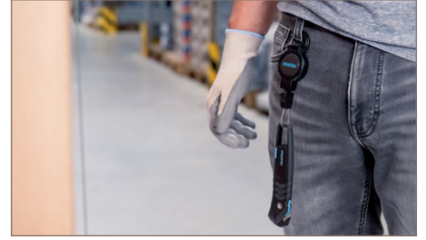
Knife at rest (without open blade).